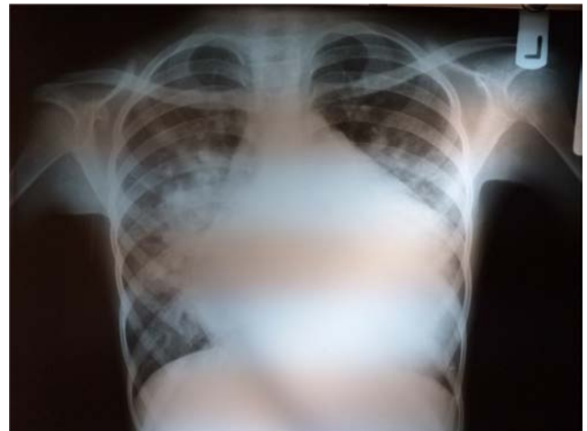
Figure 1. Chest X-ray showing cardiomegaly and pulmonary plethora.

10 mm/ hour) where all essentially normal.