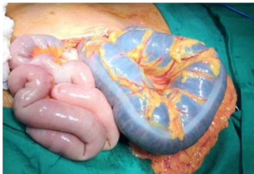
Figure 4. External View of Blood Filled Colon.

Laparotomy then performed and blood was found in the bluish colon along the ascending colon to sigmoid. The surgeon decided to do extended right hemicolectomy and end-to-end anastomosis of the ileum to the descending colon (Figure 4 & 5).