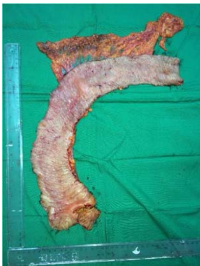
Figure 5. Excised Part of Colon.

Postoperative hemodynamic conditions were stable. However, rectal bleeding occurred again and the patient's condition worsened until the day 23 rd after open heart surgery,