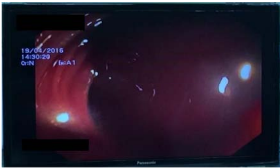
Figure 3. Colonoscopic View of Blood Filled Colon.

profusely, so the surgeon decided to do a colonoscopy with a double set up laparotomy. Colonoscopy showed an active bleeding from internal hemorrhoid artery and the colon was filled with blood (Figure 3).